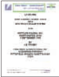
Test Report From Lightning Technologies, Inc.

Our exclusive 360° StrikeShield™ lightning protection system consists of equipment designed specifically to prevent lightning from damaging load cells and instrumentation. It's more than just a very good warranty: it really protects.