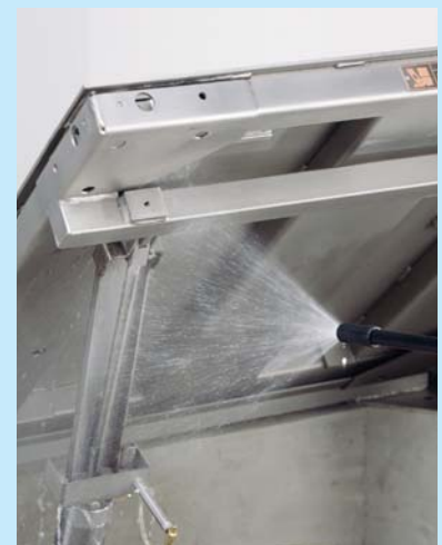
The EZ-CLEAN scale tilts up 45 degrees to expose the underside and pit for washdown.