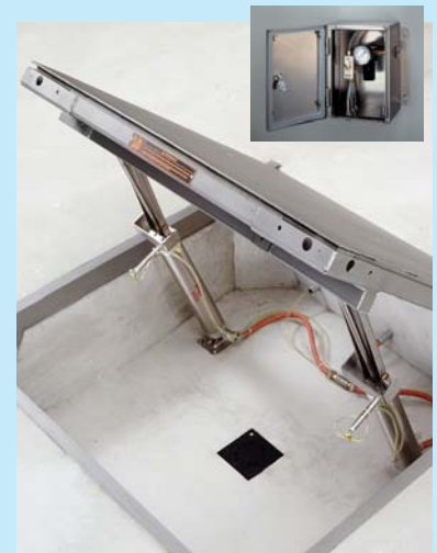
Pneumatic control and cylinders automatically lift the EZ-CLEAN scale for cleaning.