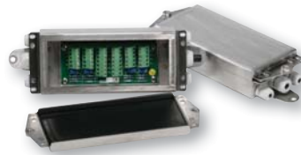
IP69K junction box for extra protection.