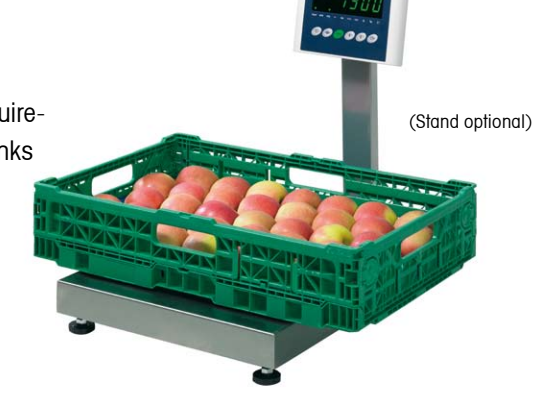
Tailor the scale to your own requirements. It's amazingly easy, thanks to a broad selection of platform sizes and different capacities.